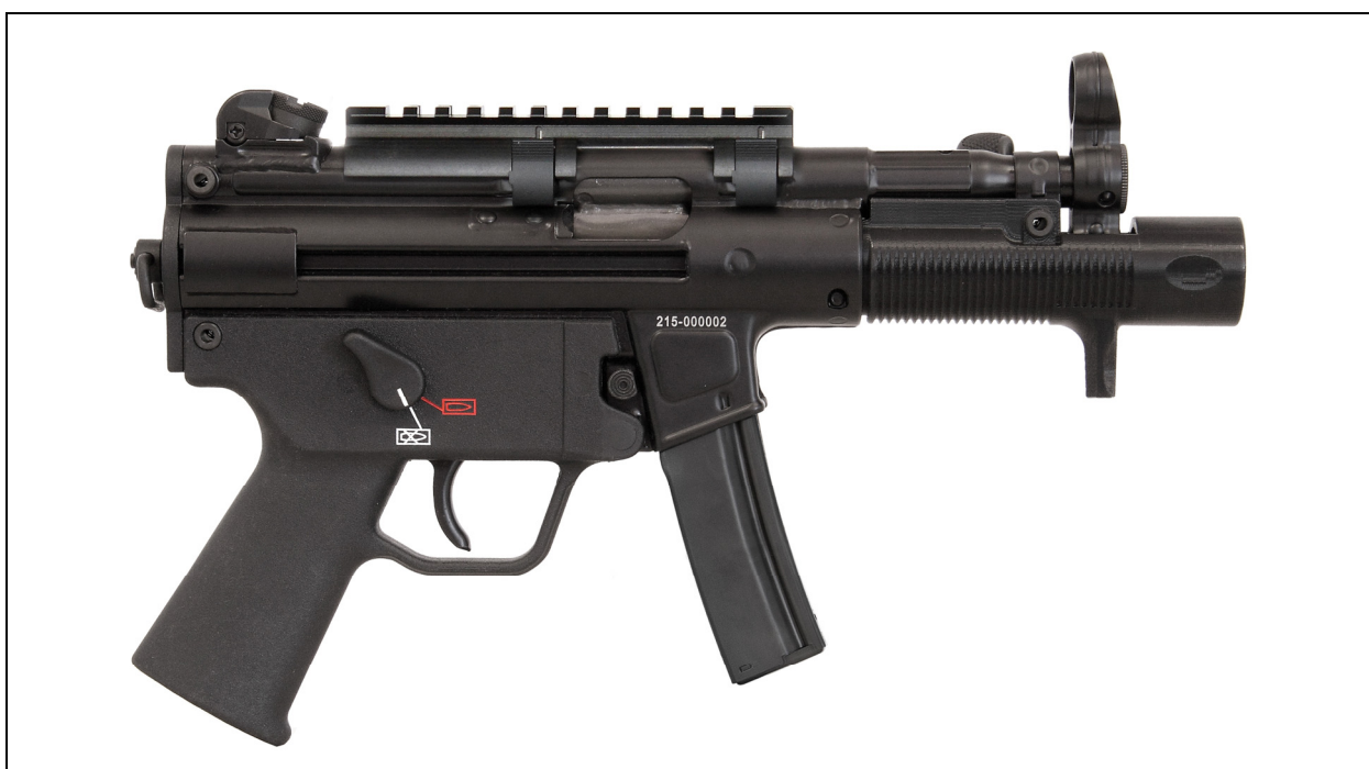
Illustration: SP5K with magazine, 15 rounds, with Picatinny top rail